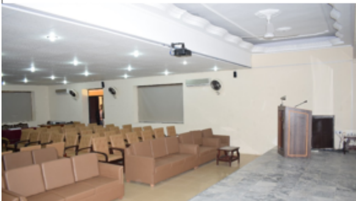
CLINICAL LECTURE HALL IN CMH